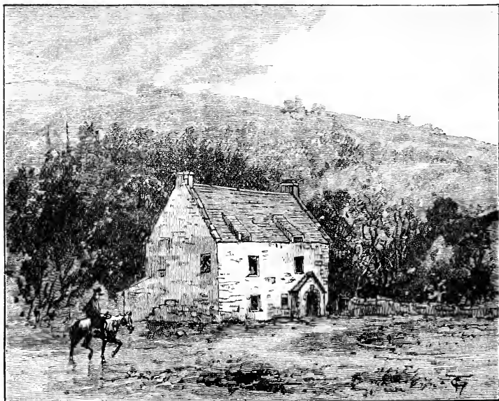
BUSH O' BEILD—RUTHERFORD'S HOUSE

AUTHOR OF 'MEMOIR AND REMAINS OF ROBERT MURRAY M'CHEYNE'